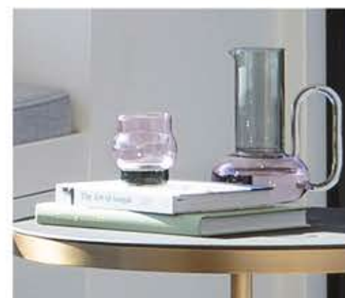
In delicate pink and grey, Tom Dixon's minimalist, mouth-blown Bump glass and jug, from Simon James Design, double as a delicate sculpture.