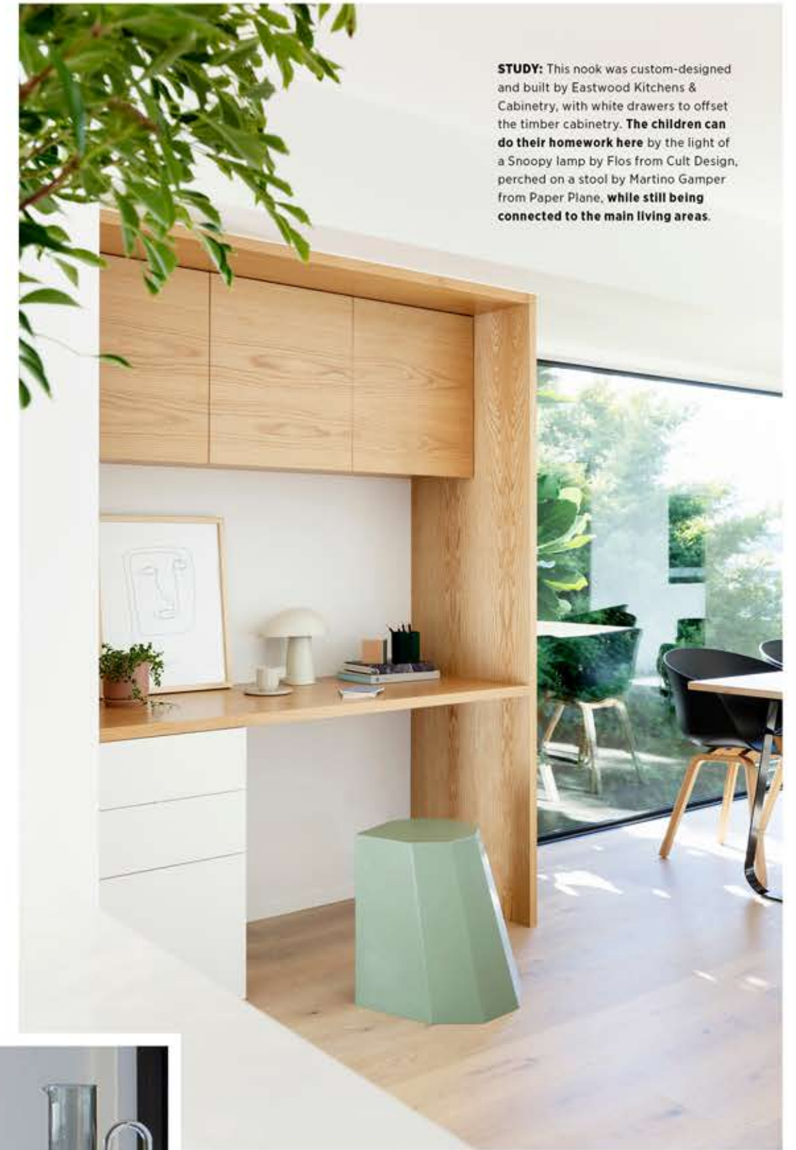
STUDY: This nook was custom-designed and built by Eastwood Kitchens & Cabinetry, with white drawers to offset the timber cabinetry. The children can do their homework here by the light of a Snoopy lamp by Flos from Cult Design, perched on a stool by Martino Gamper from Paper Plane, while still being connected to the main living areas.

THE BRIEF: The clients wanted a home that's light, bright and practical for family living. KATH'S CREATIVE SOLUTION: Introduce interesting forms while responding to the family's need for function. THE BUDGET: Mid-range. KATH'S CREATIVE SOLUTION: Invest in key areas.