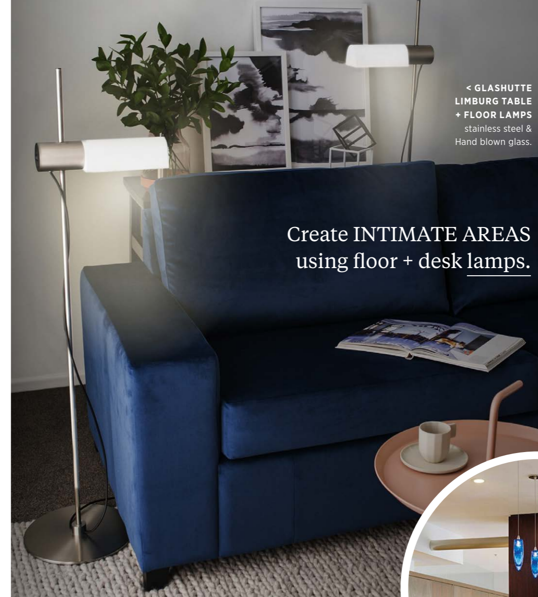
< GLASHUTTE LIMBURG TABLE + FLOOR LAMPS stainless steel & Hand blown glass.

Create INTIMATE AREAS using floor + desk lamps.