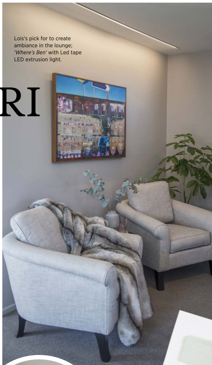
Lois's pick for to create ambiance in the lounge; 'Where's Ben' with Led tape LED extrusion light.

WALL PAPER in 'Butterfly Garden' for a vibrant look and feel.