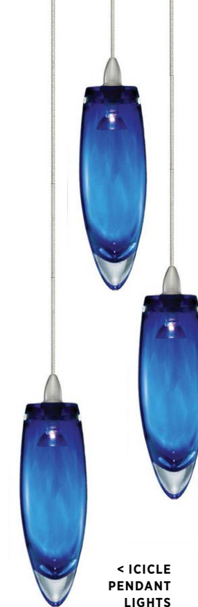
< ICICLE PENDANT LIGHTS for a modern Contemporary look to the kitchen.

Create INTIMATE AREAS using floor + desk lamps.