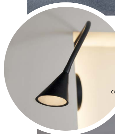
< FLEXIBLE READING LIGHT the 'Egoluce Italian Led flexible reading light' provides a comfortable and even spread of light.